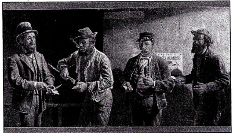
A painting showing an African American voting in 1866. To the Polls by T.W. Wood.

separate and unequal in many key ways. Clever legal tricks were used to prevent most of them from voting. The Ku Klux Klan and other violent organizations made sure they were too frightened to try to fight back.